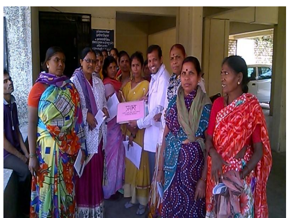
Cervical cancer screening camps in the community